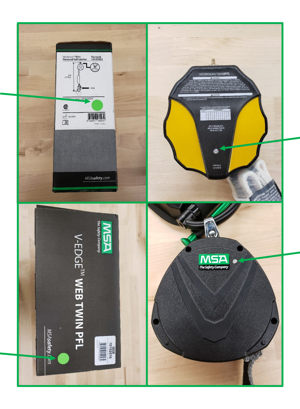
Figure 1 – Markings on MSA Inspected Product