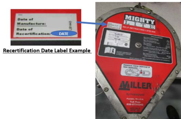
Figure 2: Recertification Label Example