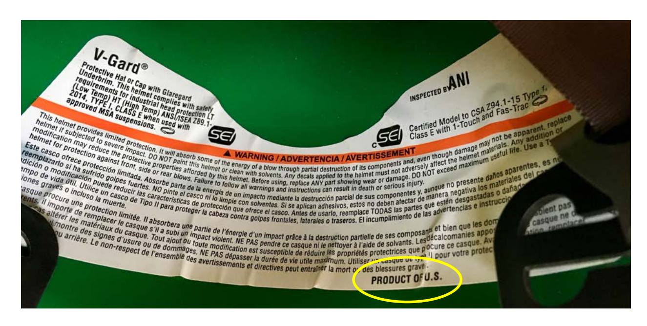
Figure 6 – V-Gard Label with PRODUCT OF U.S.