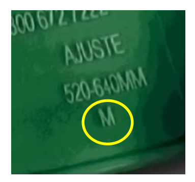
Figure 3 – Medium Size