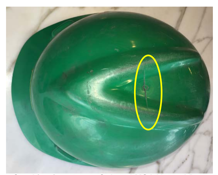
Figure 1 – Cracking in a Green Colored MSA V-Gard Protective Cap

MSA is issuing this Safety Advisory to inform you that MSA has received field reports that some green colored MSA V-Gard Protective Caps are cracking. The cracking occurs at the top of the cap, as shown in Figure 1, and is not caused by an impact to the cap. MSA has confirmed that the cause of the cracking is limited to green colored, medium size MSA V-Gard Protective Caps and that corrections have been made to prevent recurrence.