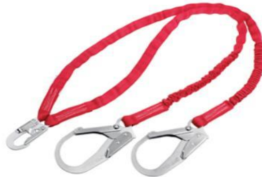
1340250 – Pro-Stop 100% Tie-Off Shock Absorbing Lanyard

The affected lanyards subject to recall are also used in the following Protecta Kits: