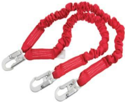
1340141 – Pro Stretch 100% Tie-Off Shock Absorbing Lanyard

Capital Safety is aware of a reported inadvertent disconnection during use of the locking snaphook used in a series of Y-shaped Protecta lanyards with twin elastic lanyard legs that both attach directly to the eye of the snaphook. The locking snaphook used on these lanyards is part number 9502573. The affected products are: