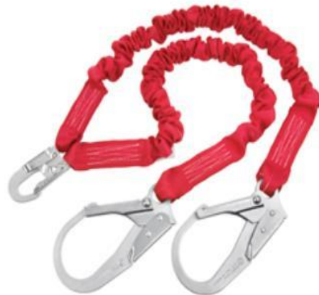
1340161 – Pro Stretch 100% Tie-Off Shock Absorbing Lanyard