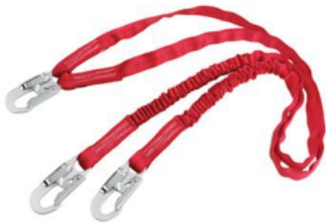
1340240 – Pro-Stop 100% Tie-Off Shock Absorbing Lanyard