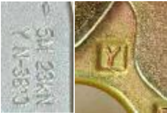
Figure 2: Typical YOKE Industrial Corp. hook markings.