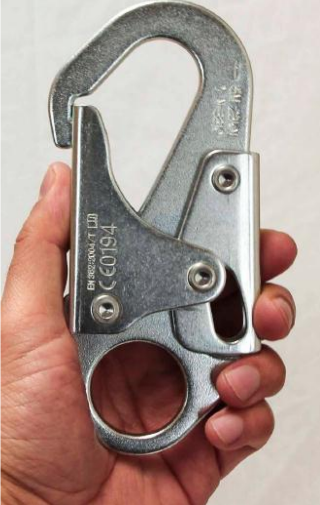
Figure 5: Picture of hook with “tail” of rivets exposed