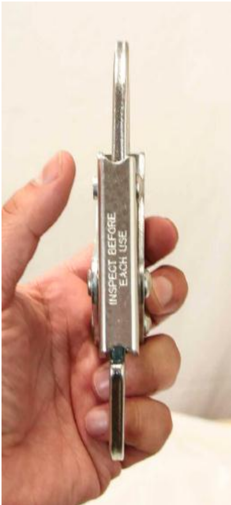
Figure 6: Turn hook to side and push "Tail" end of rivets with thumb or finger