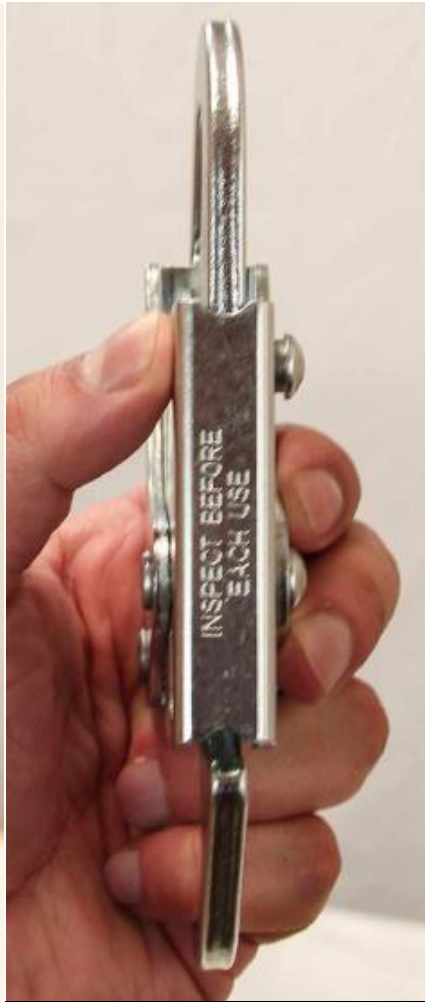
Figure 6A: Attempt with pressure to unseat rivet