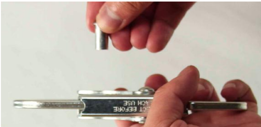
Figure 7: Fully removed rivet