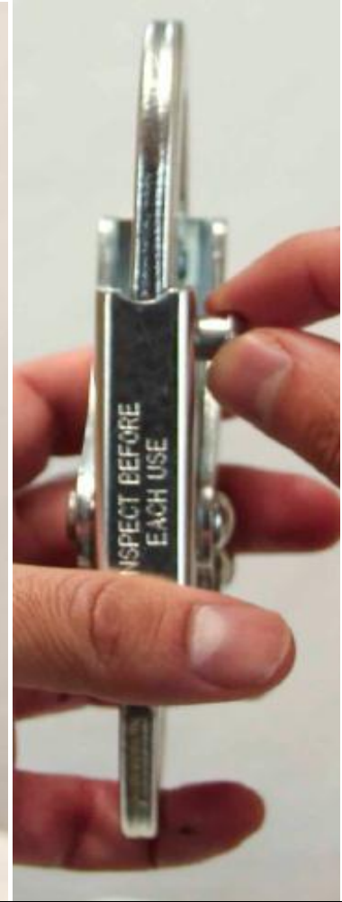
Figure 6B: Use opposite hand to pull rivet free of hook